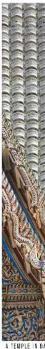
A TEMPLE IN BANG RAK