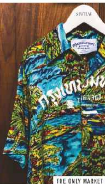
THE ONLY MARKET

INSIDE TIP 'I often work with the brand Dry Clean Only , whose pieces have been worn by Beyoncé and Rihanna, and I admire the designs of Realistic Situation , which I think really represent the new Bangkok – modern yet nostalgic.'