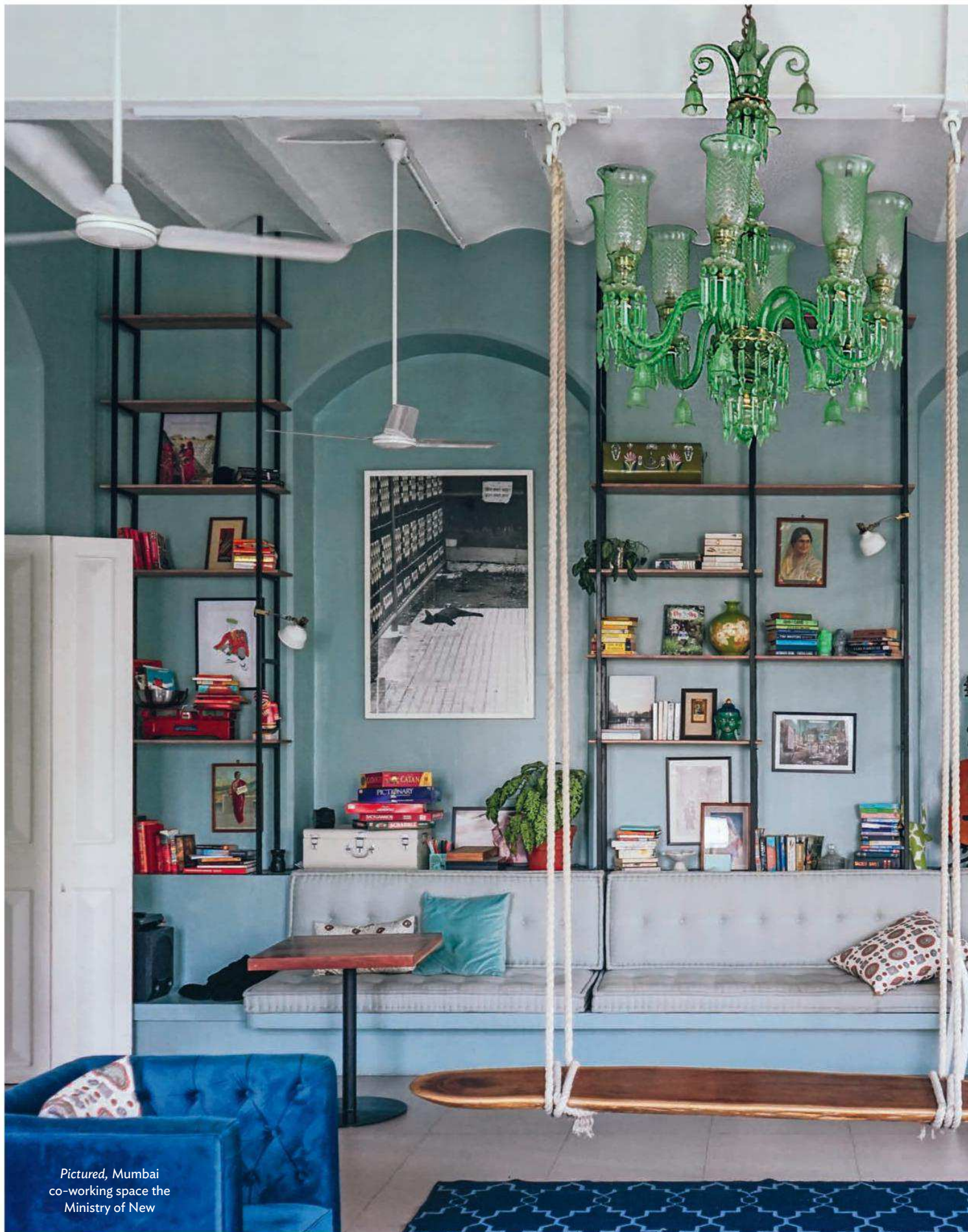
Pictured, Mumbai co-working space the Ministry of New